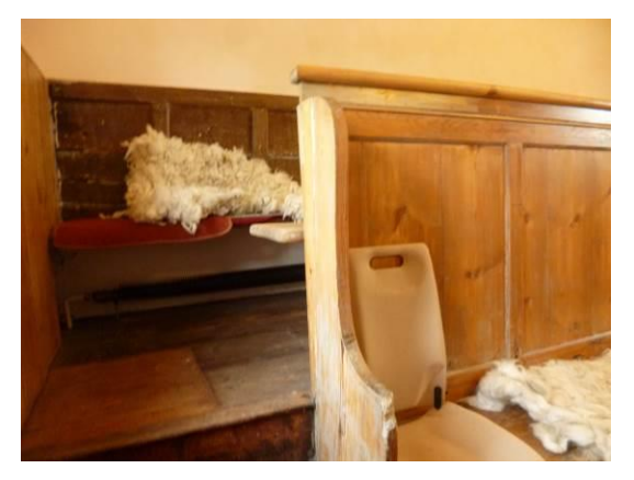
Fig.2: stand with fixed benches of varying dates

The meeting house interior is divided into two unequal spaces with the main meeting room to the south-west. The stand is against the south-west wall; this has oak panelling to the rear dado, end steps, a fixed pine bench to the front, and pine tongue and grooved dado to side walls, ramped to the stand; the pine joinery appears to be early nineteenth century in date, but the oak panelling is earlier. The smaller meeting room to the north-east is separated by a simple horizontally boarded oak screen with top-hung hinged shutters. Narrow stairs in the north-west corner lead to the gallery; the gallery floor is supported on a pair of chamfered posts and two chamfered beams with exposed joists and the gallery front is plainly panelled. The matching stone fireplaces on both floors, each have chamfered arrises and deep chamfered cornices. These fireplaces and the oak joinery are typical of the late seventeenth century. The ground floor fireplace has a nineteenth century cast-iron grate. Walls and the flat ceilings are plainly plastered with lime-wash finish. Floors are boarded in pine. The 3-bay roof has two tie-beam trusses with struts; one has curved principals.