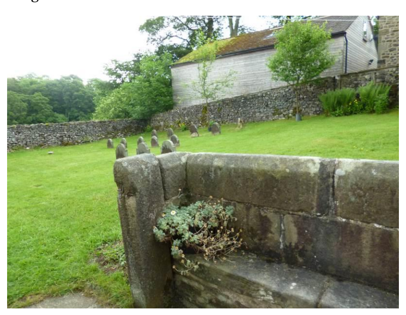
Fig.5: burial ground and stone bench set in wall, from the west

The sloping burial ground adjoins the meeting house on its south and east sides, enclosed by drystone walls. The roughly L-plan area is laid to grass with rows of head stones towards the east end; the stones have arched tops in the usual Quaker style, dating from the second half of the nineteenth century. A low ashlar wall separates the paved yard on the south-east front of the meeting house from the burial ground; the wall has an integrated stone bench to the side facing the meeting house and the top of the wall is chamfered. This unusual feature is hard to date; it is said to be seventeenth century in date, but may be later. A gateway with flat