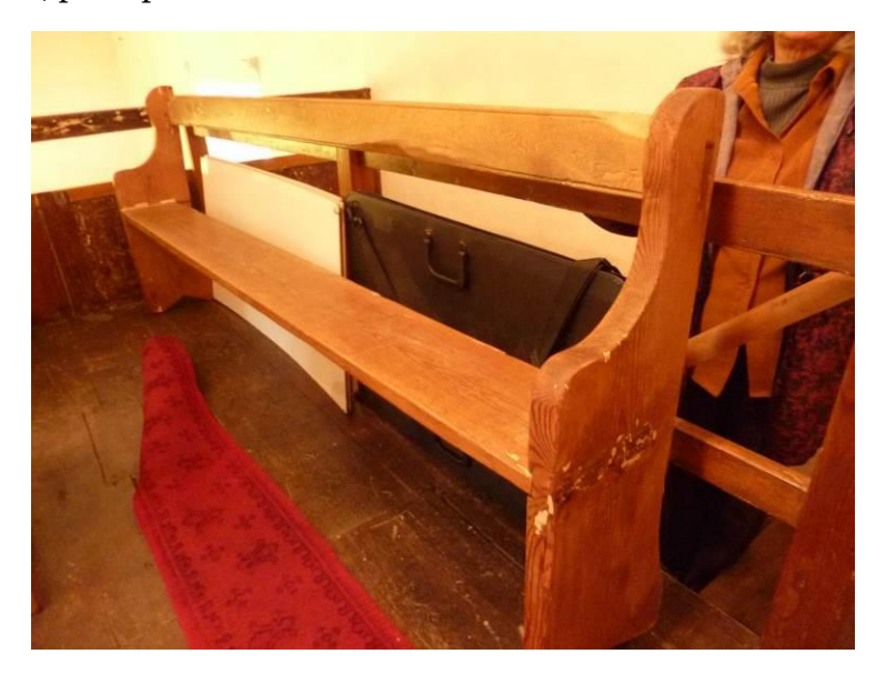
Fig.4: pine bench on gallery with back rail inscribed JB 1826

The meeting house contains a collection of pine benches of varying design, including several with reversible backs. One of the benches with solid ends on the gallery has the date 1826 on the back of the rail, perhaps re-used from another bench.