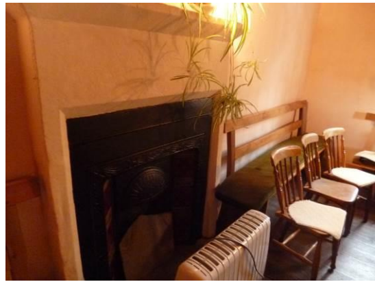
Fig.3: one of two stone fireplaces in the smaller rooms to the east end